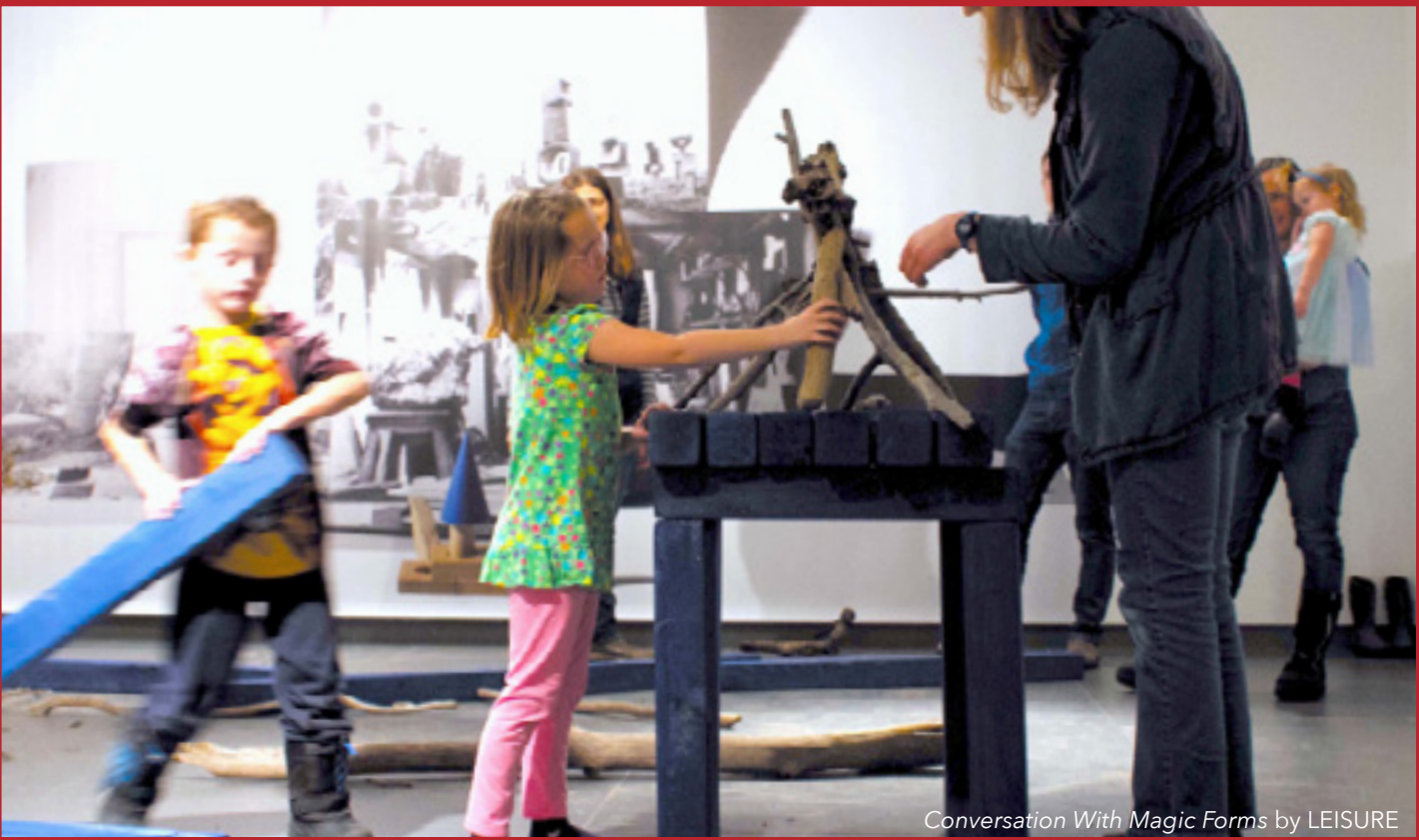
Conversation With Magic Forms by LEISURE