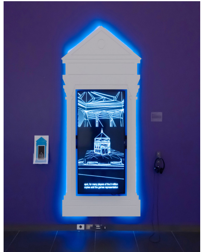
SpekWork, Blindspot , Video Recording of Gameplay, 2021.